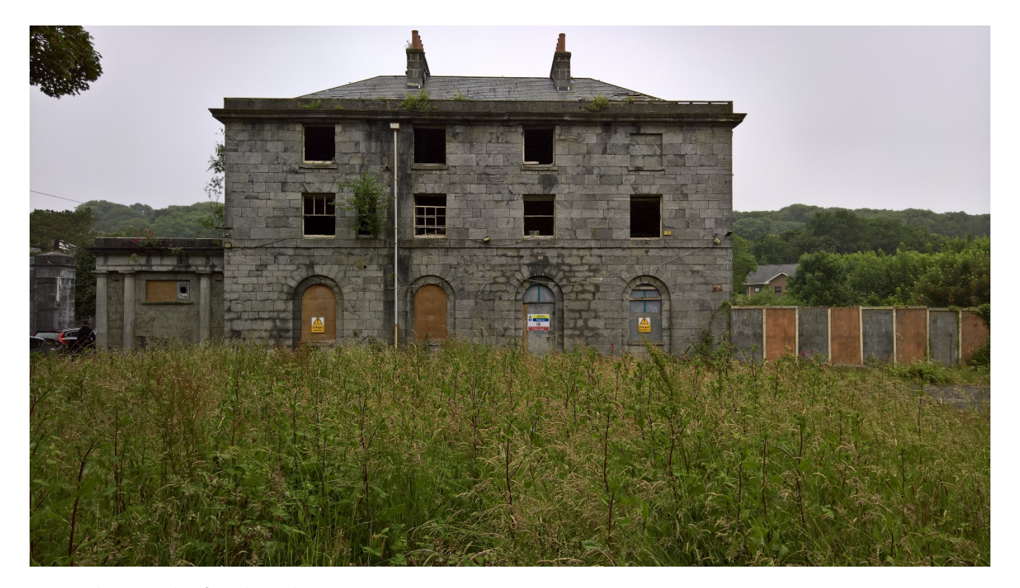
Figure 1 The Commodore from the north

These notes are prepared with the vision that this building should <u>always</u> be the focus of a community led project that will provide leisure, employment and educational opportunities for the residents of Pembroke Dock and its hinterland.