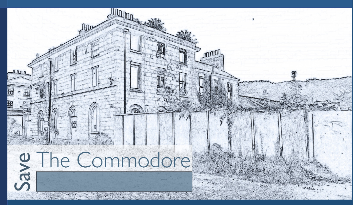
The Commodore Trust